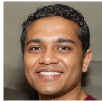
By: Indrajit Kumar

With the inauguration of India-Bangladesh Friendship Pipeline (IBFP) for diesel supply from India to Bangladesh's northern district on Saturday, bilateral relations between the countries have reached a new height. The pipeline, first of its kind in South Asia, will make Bangladesh's diesel import a lot more cost-effective and secure. While inaugurating the pipeline jointly with Prime Minister Sheikh Hasina, Indian Prime Minister Narendra Modi has rightly termed the pipeline as a reflection of Bangabandhu's vision of friendship.